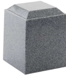
Capri Solid Charcoal Solid Composite