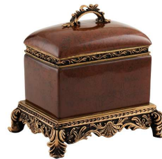
Sheffield Chest Porcelain