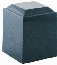
Capri Solid Emerald Solid Composite