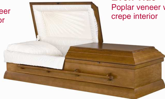
Even Tide Poplar veneer with rosetone crepe interior