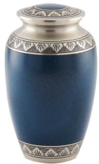
Athens Pewter Blue Brass