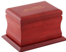
Amherst Cherry Wood