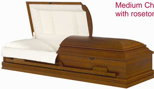
Rockdale Medium Cherry finish veneer with rosetone crepe interior