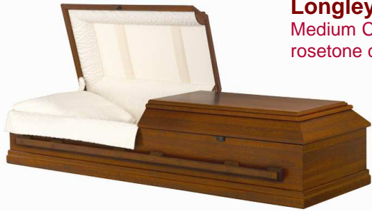
Longley Medium Cherry finish with rosetone crepe interior