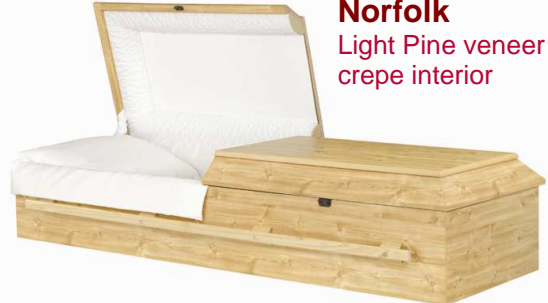
Norfolk Light Pine veneer with white crepe interior