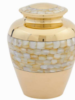
Mother of Pearl Brass