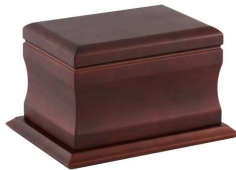
Amherst Walnut Wood