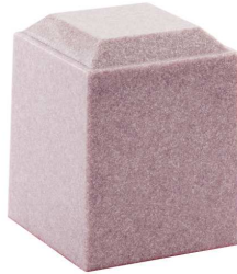
Capri Solid Blush Solid Composite