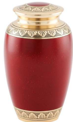
Athens Brass Sienna Brass