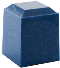
Capri Solid Sapphire Solid Composite