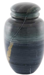
Forest Haze Marble