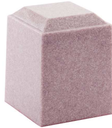
Capri Solid Blush Solid Composite